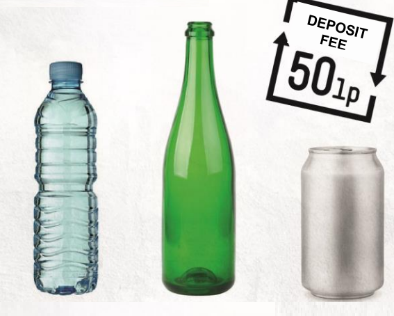
plastic beverage packaging, except for dairy and dairy products

Do you know that for beverage packaging larger than 0.2 litres you can get a deposit fee refund of 0.50 kn? You can drop off this type of packaging at any shop selling beverages with a surface area larger than 200 m² .